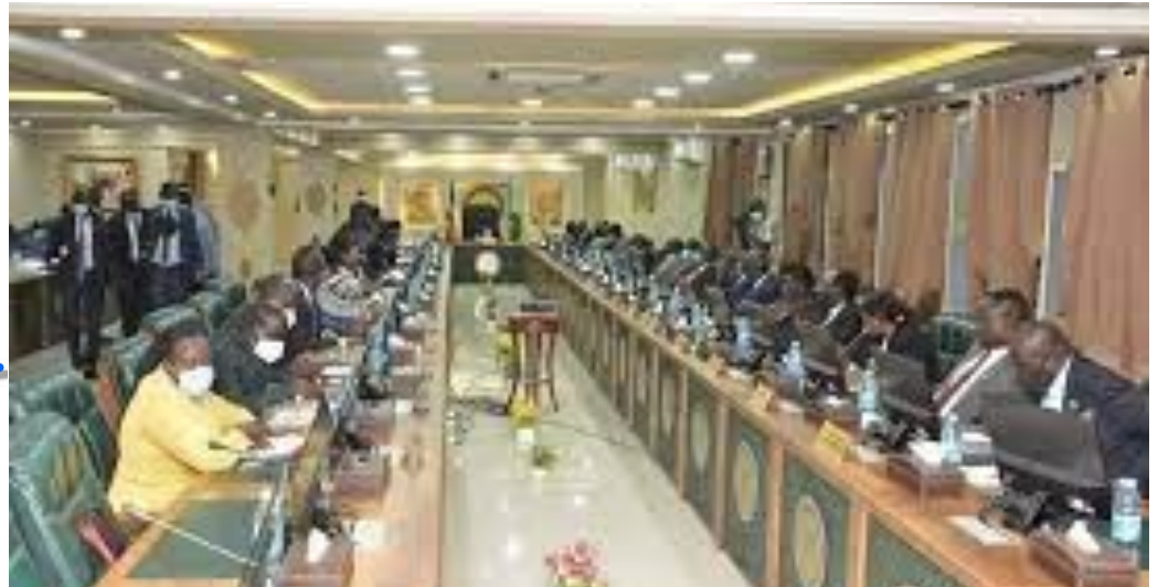
(File photo). Ministers in the councils' meeting passed National Occupational Safety & Health policy presented by the Ministry of Labour. Page 2.