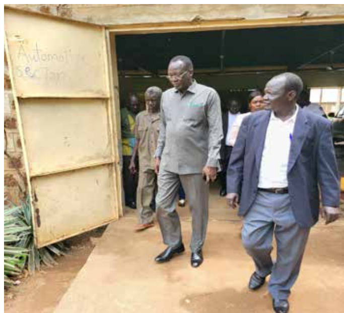
Main exit from auto mechanic section.

The training centre was established since the British time in Sudan regime. The long civil war between