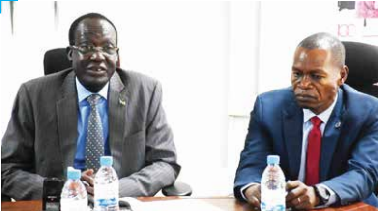
Hon. Minister, James (right) and Hon. Minister, Joseph (left)

N ational Ministry of Labour, Hon. Gen. James Hoth has officially launched the website of the Ministry of Labour on 27 th /October/2022. The website " www. http://mol.gov.ss/ " contains 9 menu with 42 web pages, which are developed with the financial support and human resources from South Sudan NGOs Forum and other partners for putting all vital information of the Ministry of Labour in a technological accessible source ready to help job seekers. And update public find the right information they want at anytime, anywhere.