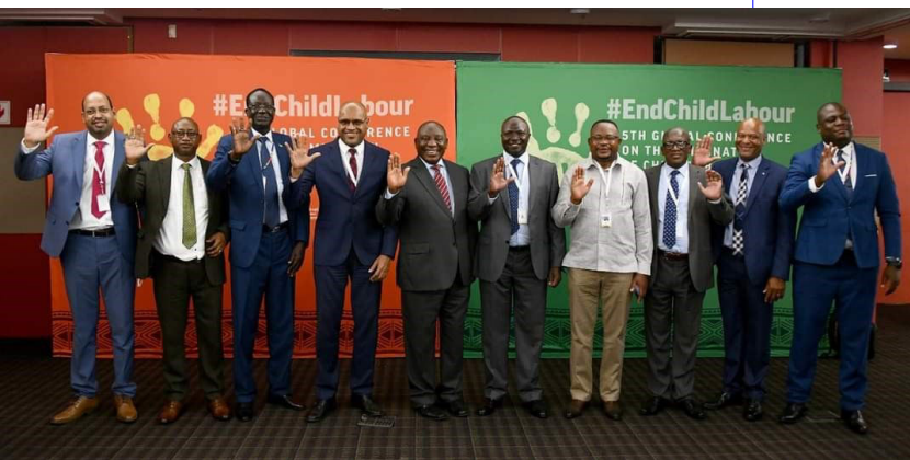
Let’s stop child labour!

South Sudan’s floods, corona virus and education for young people were among the tops discussions in South Africa conference, Minister of Labour, James Hoth Mai explained during the conference in South Africa.