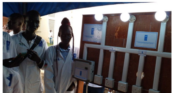
20/06/2022, Electrical Installation Exhibition

On the graduation day students completed 3 months training in electrical installation work, displayed their product and talents.