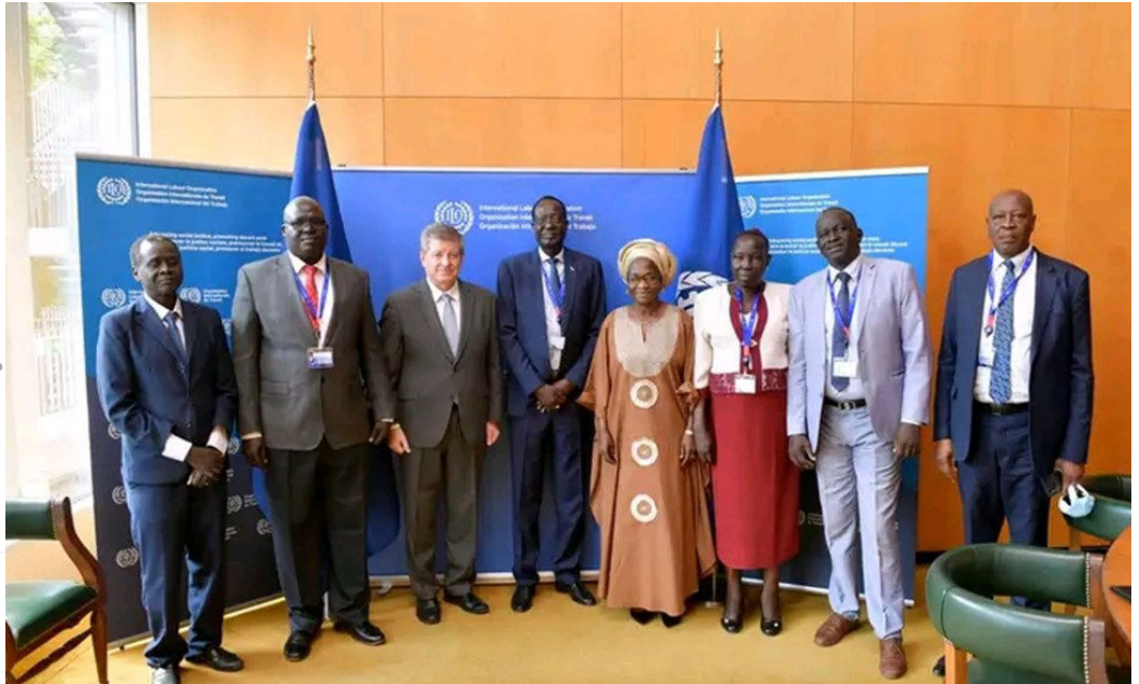
Minister of Labour, Hon. James Hoth Mai led the South Sudan delegation to attend the-Page 2

If you need a credible and reliable source of information about the Ministry of Labour and Industrial Relations reach us on web; https://mol.gov.ss/