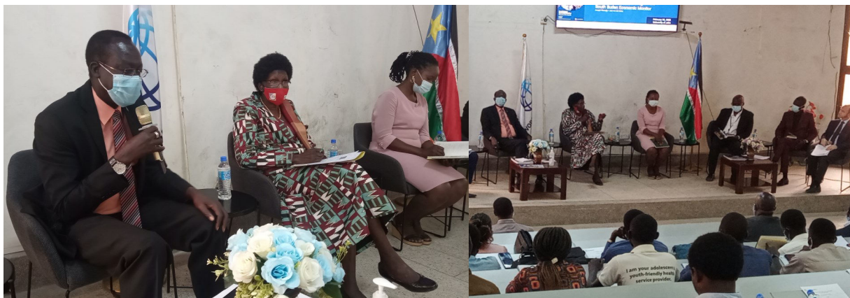
Hon. Minister of Labour, Gen. James Hoth addressing the Private Sector and Students in UoJ

Hon. Minister of Labour, James Hoth and the World Bank recently in the University of Juba (Samani Hall) called for vibrant jobs opportunities to be introduced to support jobless youths in South Sudan. The appealed was centered to private sector in a launch of 2022 South Sudanese Economic Monitoring toward a job agenda.