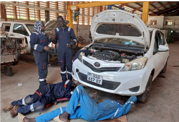
Juba MTC; Females' Students and others on Car Repairs

Statistically, in this academic year Juba Multiservice Training Centre (MTC) has enrolled 700 students on vocational skills training and development, to attain quality and innovative skills from more