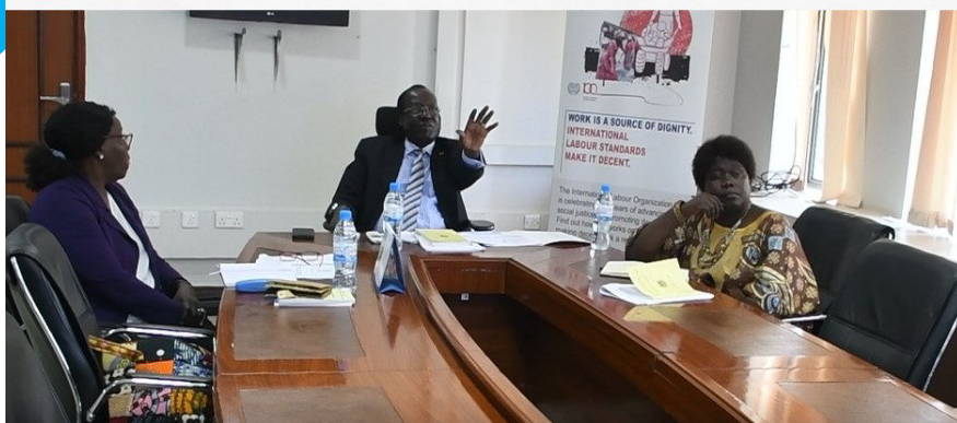
Hon. Minister of Labour, James Hoth Meet Two MP From East Africa Community

Ministry of Labour met with Members of Parliament (MPs) from East Africa Community recently in the meeting hall, Juba. The purpose of the meeting was to assess how the government work is running in South Sudan, so as to harmonize the articles signed in the treaty of East Africa Community. Hon. Minister James Hoth unveiled good progress in his Ministry. "I briefed them on what we do in implementing the EAC common market protocol, the ministry is working to protect the rights of migration of people in South Sudan". Minister asserted.