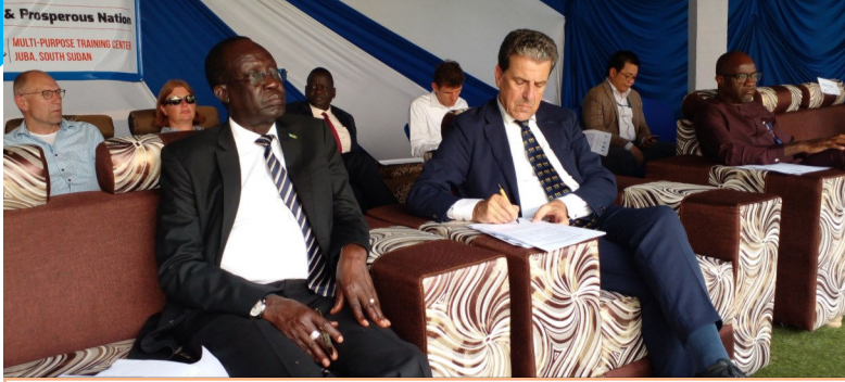
Minister of Labour James Hoth & the Partners supporting youths in vocational training and Skills development noting key issues.

Ministry of Labour; James Hoth Mai and Partners of the Minister of Labour, UNDP representative were at the podium taking key notes to address challenges of youth unemployment in South Sudan. As 598 students graduated in various trades at Juba Multiservice Training Centre (MTC) on 20 th June, 2022.