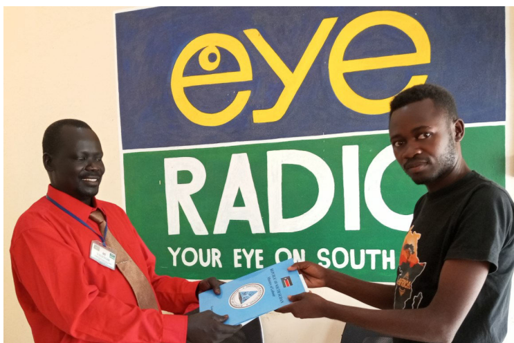
Ministry of Labour Senior Inspector; Public Relations and Protocol meets Eye Radio delivers credible information.

The Ministry of Labour engages with media houses disseminates credible and reliable information to its audiences through trusted media houses. Some reliable infor-