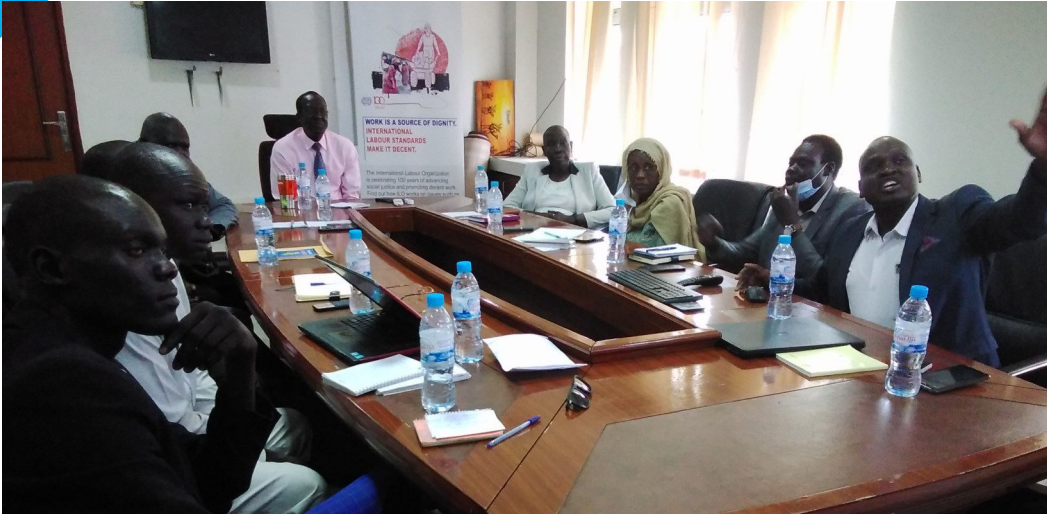
Senior leadership in the Minister of Labour attentively analyzing Occupational Safety & Health Regulatory Document.

The seniors leadership in the Ministry of Labour under the auspice of Hon. Minister of Labour, James Hoth listened to the presentation of the Directorate of Occupational Safety and Health to analyze and add their inputs to the regulatory documents.